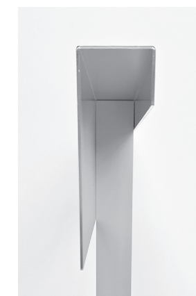
Side view with folded text carrier

Both components are anodized in silver as standard.