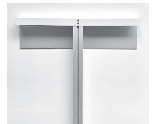
Back with attachment of the text carrier.